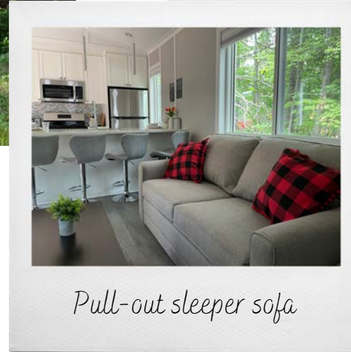
Pull-out sleeper sofa