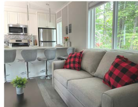
Pull-out sleeper sofa