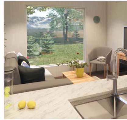
Large picture window