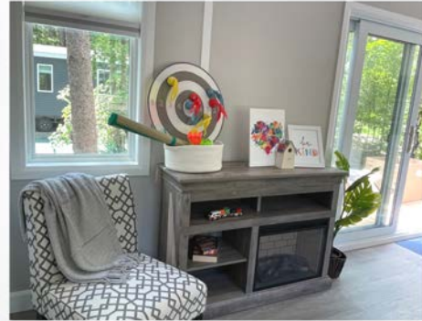
Bright living space