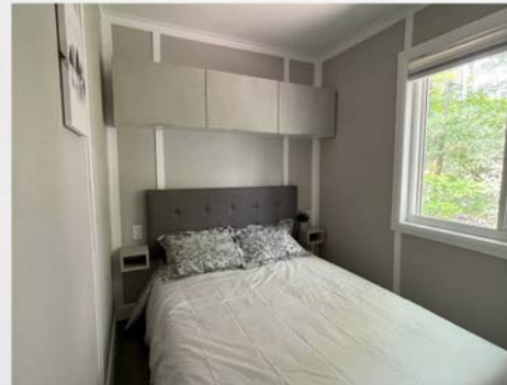
Lift bed & added wall storage