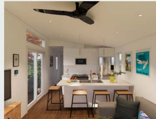
Bright & open kitchen space