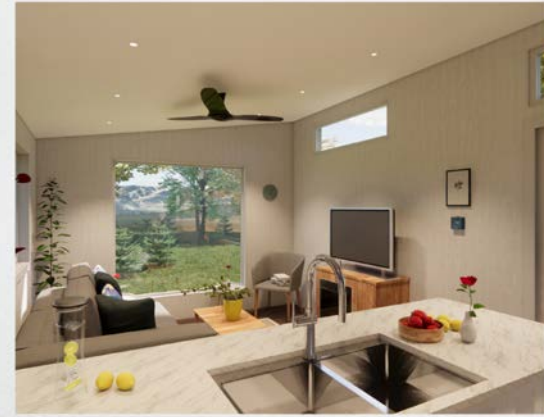
Large picture window for great views

This floor plan features two bedrooms, both located in one half of the model. The other half of your model is dedicated to kitchen & living spaces with large windows providing for great views.